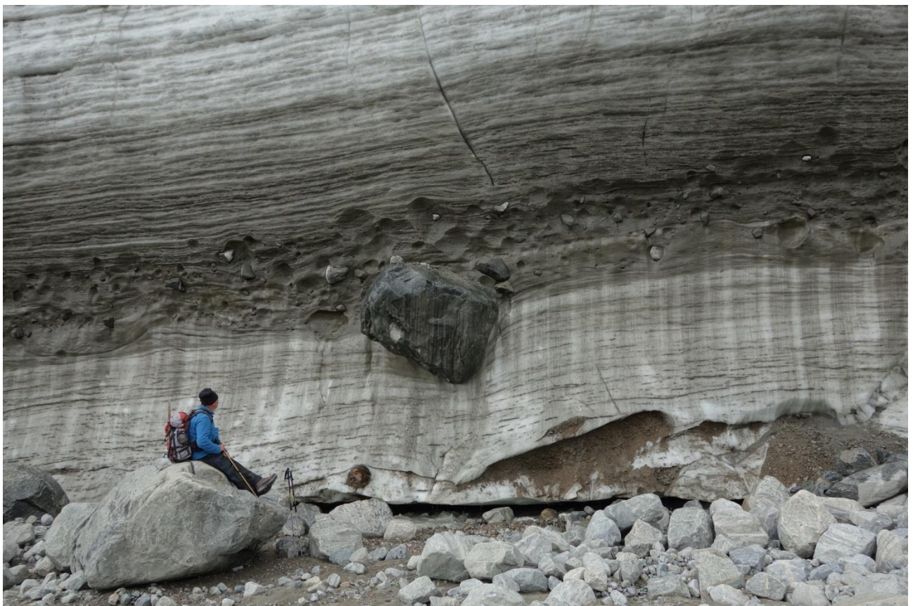
Figure 1: Active sediment transport within the debris-rich basal ice layer of an outlet glacier on Bylot Island, Canadian Arctic (N 72° 57' 50", W 78° 25' 13"). Note the large erratic boulder entrained within the ice. Figure for scale.

Glaciated landscapes are best understood as part of a system, at the heart of which is the transfer of sediment through the glacier (figure 1). Debris is produced by erosion in some locations, entrained and transported by ice and water, and deposited in other locations. The energy driving this system is the energy that drives the motion of the ice and water through the glacier, and is ultimately connected to the global hydrological cycle and to the physical impact of gravity on surface materials. The system can be observed at a range of timescales: processes can be measured in action at scales from seconds to days at existing glaciers. The effects of processes can be observed in the landscape for many thousands of years where glaciers have existed in the past. The landforms of glacial environments can be regarded as the outputs of this system. Therefore, landforms are best considered not individually in isolation but together as landform assemblages or landscapes; it is the combinations and associations of landforms that tell us most clearly the story of the system that created them and put them together.