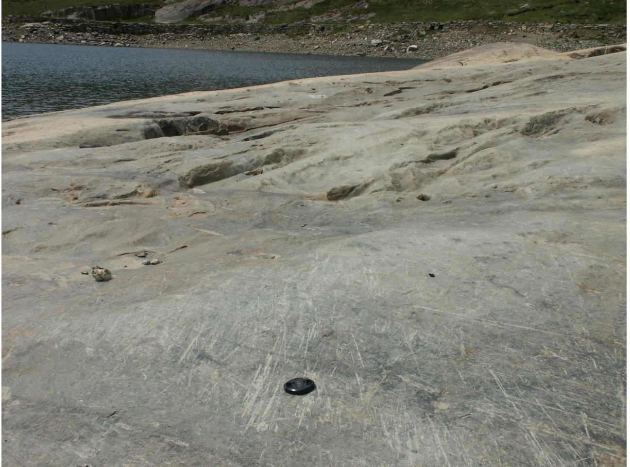
Figure 2: Striated bedrock surface in Llyn Llydaw, Snowdonia (N 53° 4' 23", W4° 2' 32"). Note the cross-cutting nature of the striations which indicates a change in ice-flow direction. Lens cap for scale.

Recent research in glacial geomorphology has increasingly focused on glacial landsystems . This is an explicitly geomorphological application of the systems approach. A landsystem is an area with a common set of features that are distinct from those of the surrounding area, not only in terms of their topographic characteristics, but also in terms of their constituent materials, soils and overlying vegetation types. This inclusion of earth-surface materials is central to the description and interpretation of depositional features such as moraines, where the internal structure and composition can reveal much about their mode of origin.