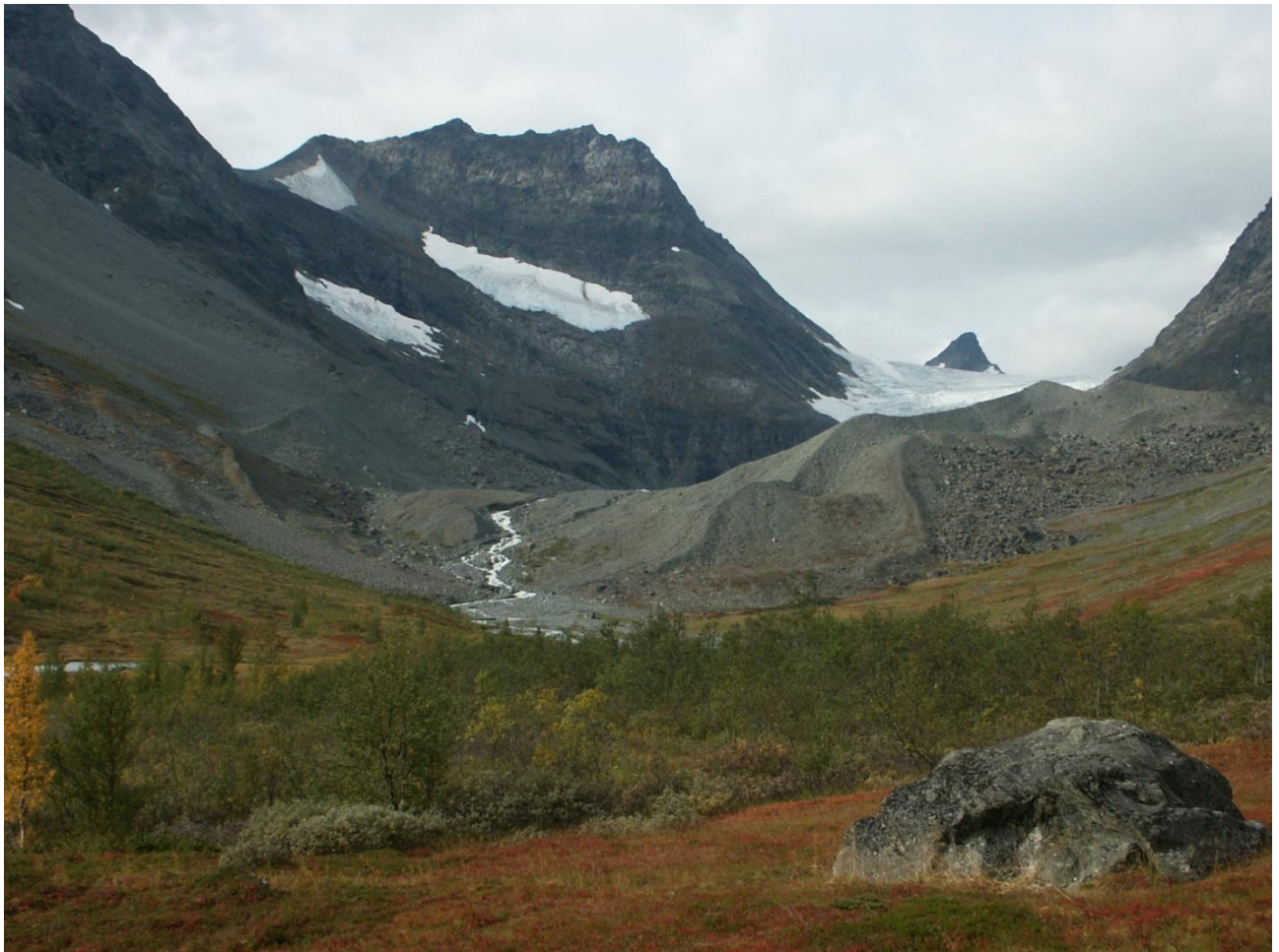
Figure 3: Steindalsbreen, northern Norway (N 69° 23' 29", E 19° 56' 54"). Topographically-constrained valley glacier occupying a classic U-shaped valley. Note the prominent end moraines relating to ice advance during the Little Ice Age in the late 19 th Century and the erratic boulder in the foreground.

climatic regime. One of the distinct advantages of the landsystems approach is the ability to reconstruct the operation of processes and the characteristics of the parent ice mass far more accurately and in far more detail. In this respect distinctive spatial arrangements of geographies of landforms are invariably far more informative than analysis of any individual landform – the whole is greater than the sum of its parts. One example of this relates glaciers surges, which are rapid advances that are not related to climate. With glacier fluctuations commonly being used to reconstruct past climate change, the ability to distinguish between climate-related and non-climate related advances is of crucial importance. Whilst attempts to identify an individual landform indicative of surges have been largely unsuccessful, ongoing research suggests that they are typically associated with distinctive landform assemblages comprising large push moraines, subglacial lineations and crevasse fill ridges. It is the combination of these landforms that tells the story of how the landscape was created; no one individual landform could tell that story.