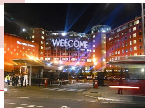
© Mike_fleming; BBC Television Centre; Flickr

What other examples of economic activity in the borough can you think of?