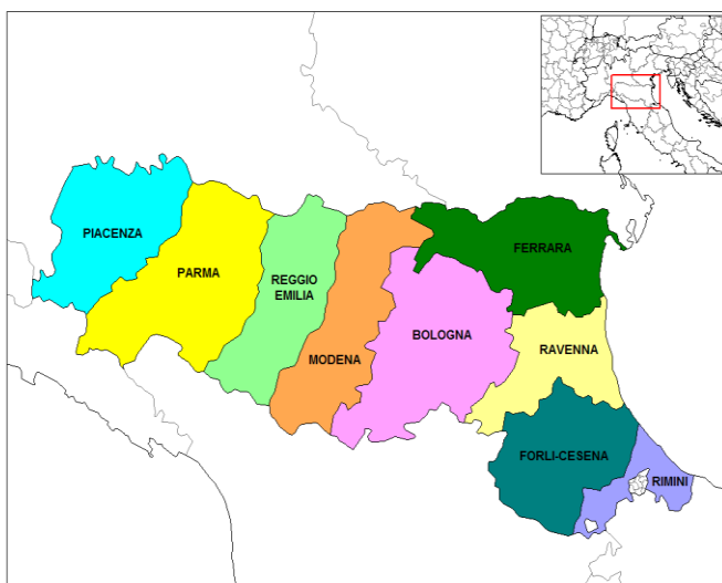
Emilia-Romagna region

Bologna grew as an Etruscan City named Felsina. It was a thriving Etruscan city which was born as part of the Etruscan Civilisation's expansion to the east coast of Italy. In Giardini Margherita there is still evidence of one of the Etruscan's burial grounds which was excavated when the park was landscaped. It is important to note that Bologna used to have a canal route and this made trade easier and the city accessible. In 189 BC Romans began their expansion of Bologna. They destroyed all evidence of Etruscan script, language and houses and developed road connections changing the name of the city to Bononia. Bologna had many rulers over time and became a thriving city in the Middle Ages. Much of Bologna's city centre today boasts incredible architecture, and evidence of Roman and medieval influence can be found around the city centre. Some of the medieval city gates surrounding the city still remain.