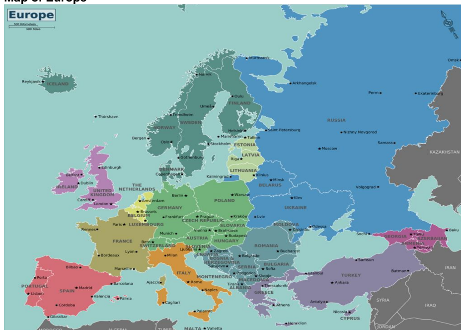
Map of Europe