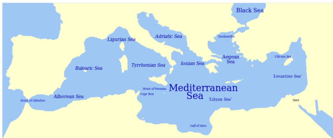
Map of the Mediterranean and subdivisions, © Wikipedia Commons

The main currents in the Mediterranean flow in from the Atlantic via the Straits of Gibraltar, travel east to the Levant, and then back along the coast of North Africa, where the water is pushed northwards towards Europe. The 'message in a bottle' follows these currents, as the water flows first towards Greece and the Balkans, then to Sicily and Italy, to France and then Spain.