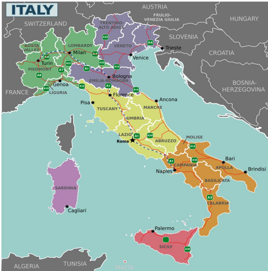
Regions of Italy